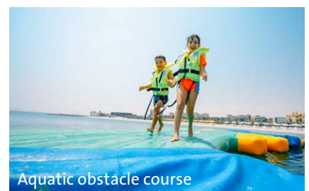
Aquatic obstacle course